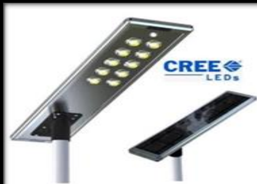
Installation of Led solar street light in the Manika commune